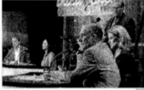
The authors of the survey, which was conducted by the U.S. Department of Justice's Office of Justice Programs, found that 23.1% of college women have been sexually assaulted or harassed, and 6 in 10 have been sexually harassed.

NEW YORK —A new survey by the U.S. Department of Justice's Office of Justice Programs shows that one in four college women has experienced sexual assault or misconduct. The survey, which is the first of its kind, found that 23.1% of college women have been sexually assaulted or harassed, and 6 in 10 have been sexually harassed. The survey, which was conducted by the U.S. Department of Justice's Office of Justice Programs, found that 23.1% of college women have been sexually assaulted or harassed, and 6 in 10 have been sexually harassed. The survey also found that 56% of college women have been sexually harassed.