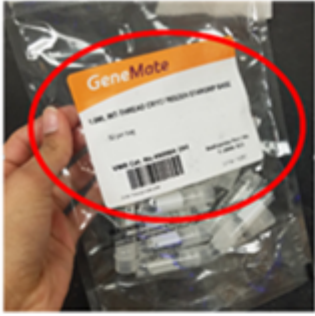
Labels or Tape on EPS or Plastic Film (remove or cut out)