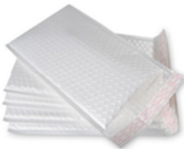
Plastic Mailers (no paper components)