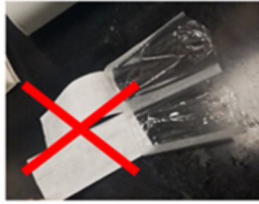
Mixed Materials (unless you remove paper part)