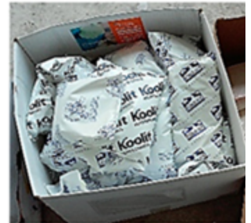
Intact, Defrosted Cold Pack