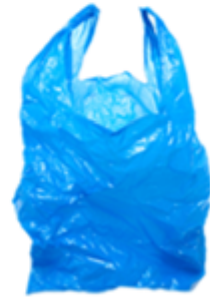
Plastic Grocery Bags