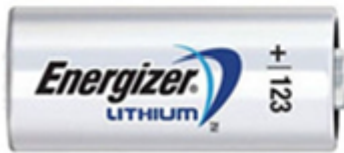
Non-Single-Use Alkaline Batteries*