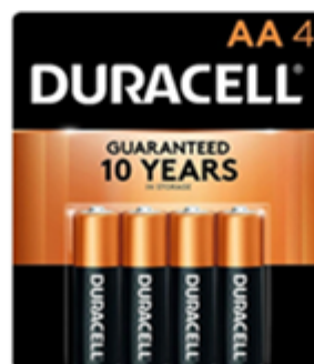
Single-Use Alkaline Batteries