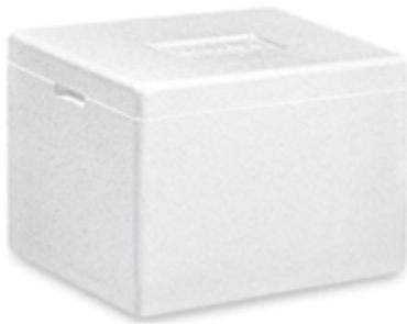
White EPS (REMOVE TAPE AND LABELS)