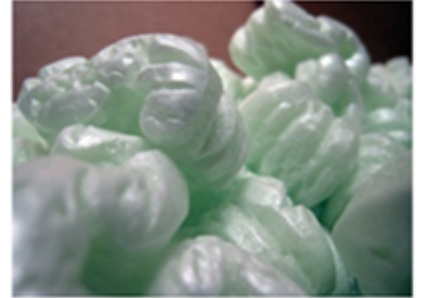
Packing Peanuts +