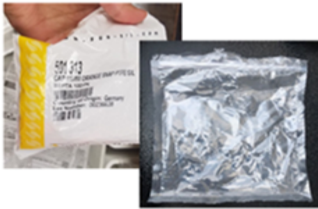
Clear or Opaque Plastic Film (REMOVE TAPE AND LABELS)