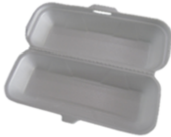
EPS Food Packaging