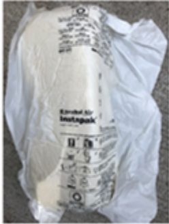
Sealed Air Instapak