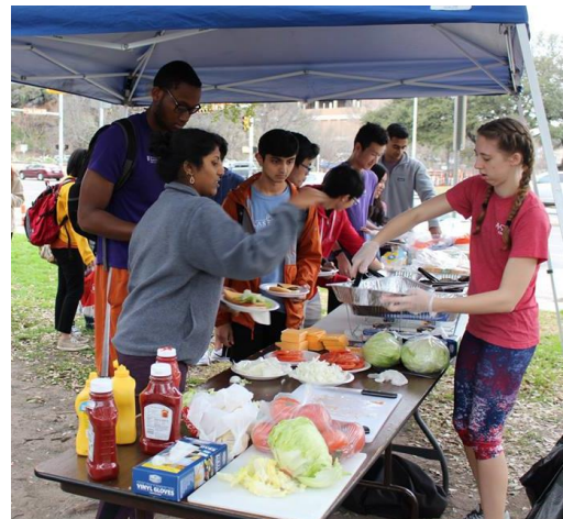
Engineering Week (E-Week) Kick-Off