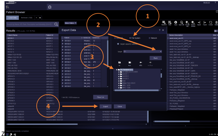
Figure 3: Export Data Dialog Window

The Export Data dialog box appears as seen in Figure 3. First, click the File System radio button, then click the drop-down arrow to Target drive D:\. Find your External HD or Flash Drive from the list of items that come up when you target the D:\ drive and click on it. Next, click the 'New' file folder and name the new folder what you named your participant.