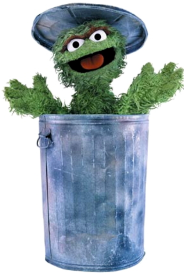
Garbage In, Garbage Out