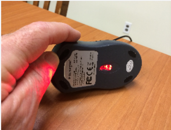
Good: Red Light

Look for a red LED on the bottom of the mouse