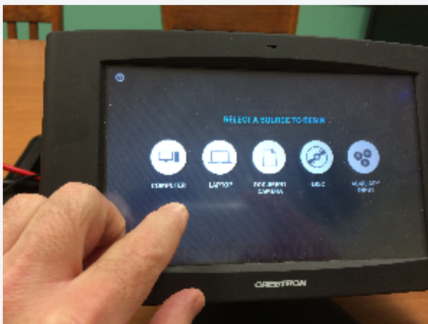
Good: Touchpanel ready at Home Screen

Touch the Touch Panel with your finger to wake it up.