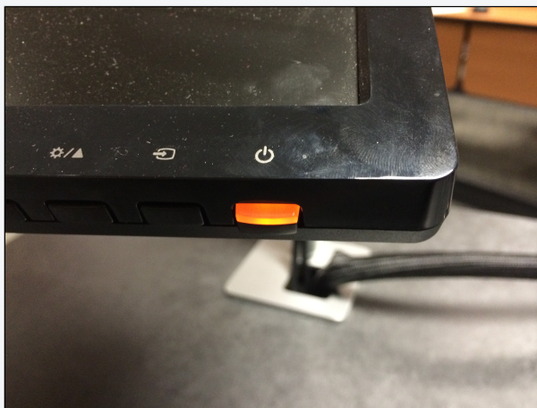
Good: Monitor On or Standby