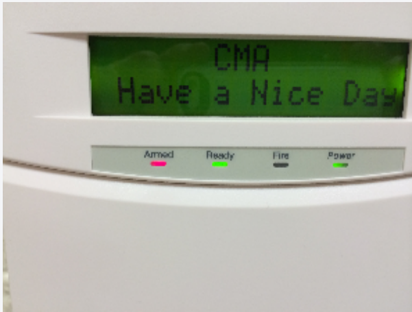
Good: Armed Red

Look for a red "Armed" LED on the left of the panel.