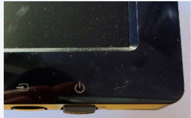
Bad: No Light