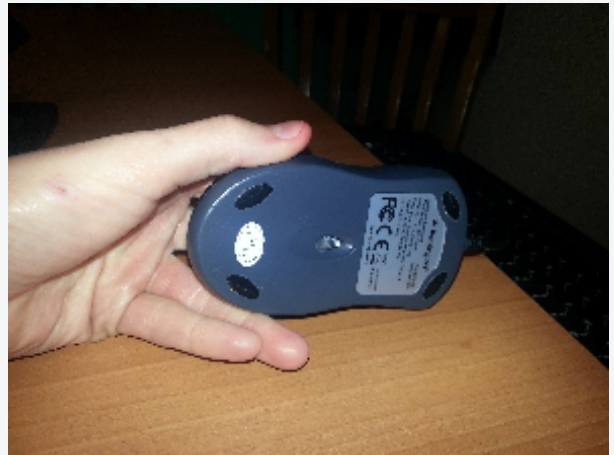
Bad: No Light

Look for an Amber (Stand by) or Blue (On) LED on the bottom right of the Mon itor.