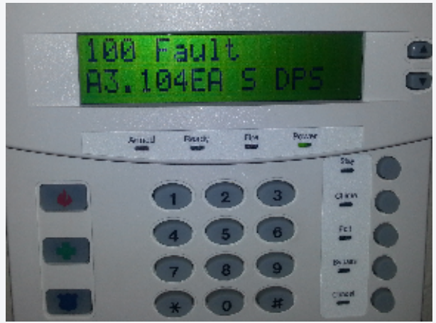
Bad: Not Armed